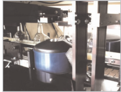
HST with non-round kit